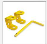
Wall Mounting Brackets Available