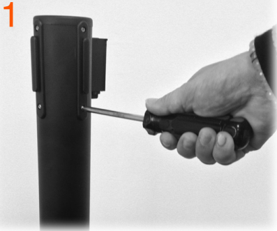
1 Loosen the four screws securing the cassette into the post