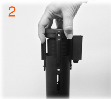
2 Slide the cassette out of the post