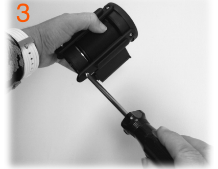
3 Loosen the lower screws slightly on the replacement cassette but do not remove them completely. Do not loosen the top screws.