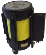
2.5" Diameter Cassette