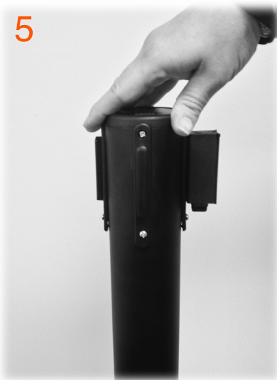
5 Slide the cassette all the way down the post slots