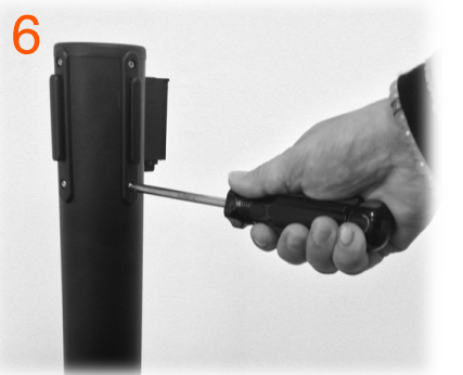
6 Tighten the screws securing the cassette into the post Note: Do not over tighten as this may affect the belt retraction.