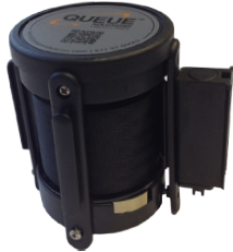
3" Diameter Cassette